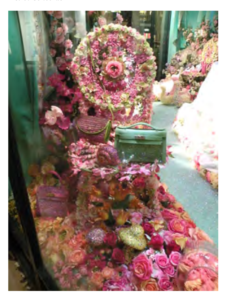
Hermés 24 rue Faubourg St. Honore, 1st. arr. Metro: Concorde